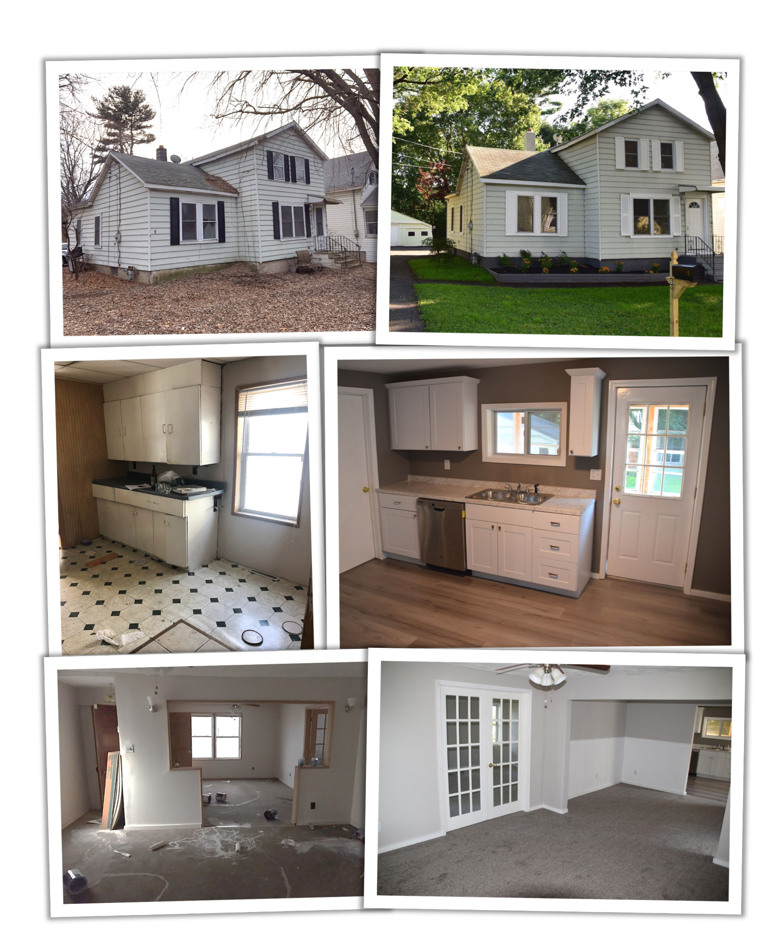
Before and after images of a rehabilitated property purchased from the Land Bank in the city of Watervliet.