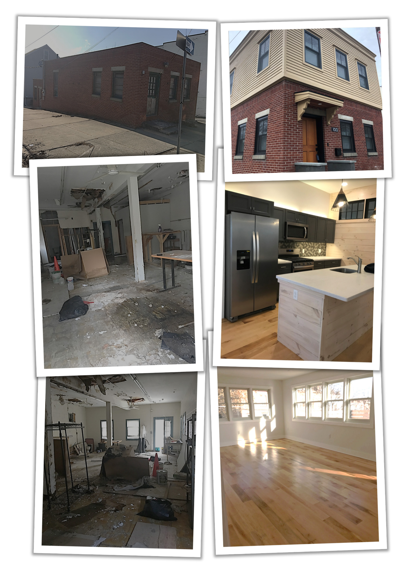
Before and after images of a rehabilitated property that was purchased from the Land Bank in the city of Albany.