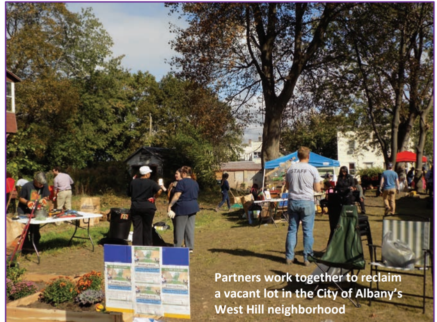
Partners work together to reclaim a vacant lot in the City of Albany's West Hill neighborhood

Our partnership with Albany County provides us with tax-foreclosed real estate and financial assistance. The Land Bank uses property sale revenue and additional grant funding to improve, demolish, maintain, and responsibly dispose of vacant and abandoned properties. This partnership enables us to eliminate harmful properties from our communities and relieve the burden these properties impose on Albany County, municipalities, and taxpayers. To date, the Land Bank has invested over $5 million in reclaiming vacant properties and enabled hundreds of properties to return to productive use.