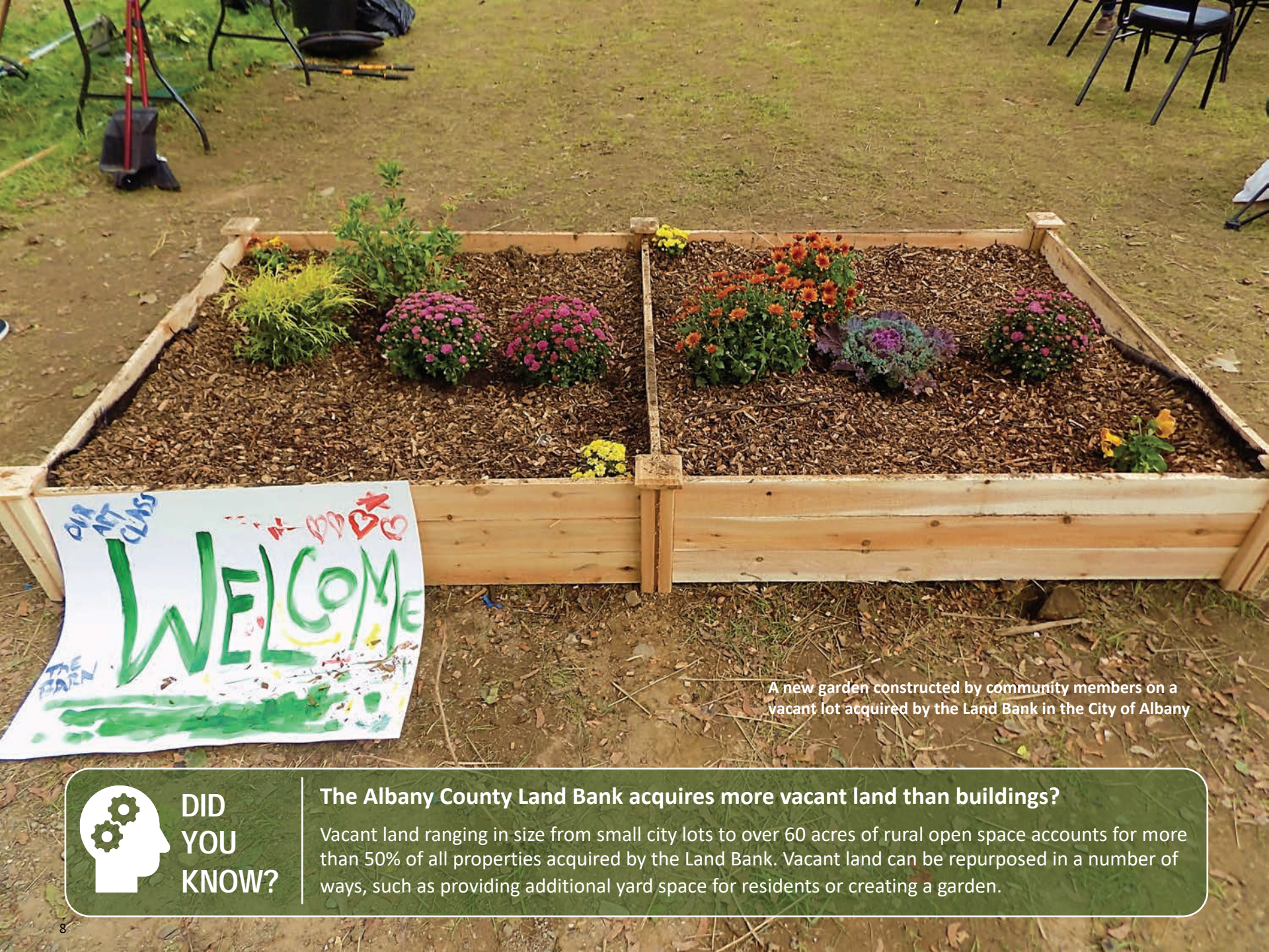
A new garden constructed by community members on a vacant lot acquired by the Land Bank in the City of Albany