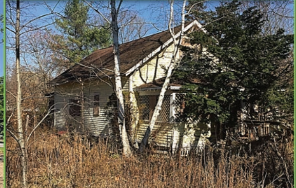
Buyer rehab in Town of Bethlehem