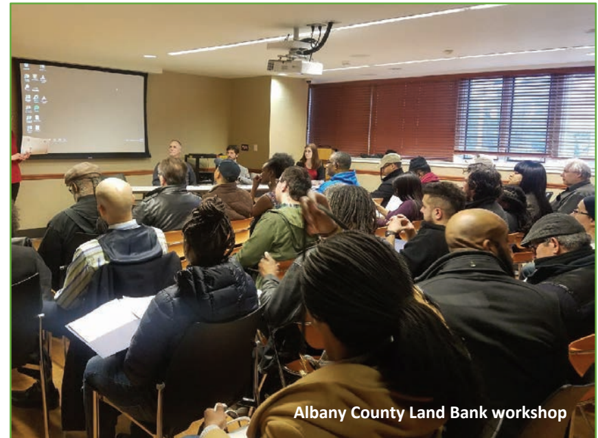
Albany County Land Bank workshop

Our enhanced community engagement model provides an accessible and inclusive forum that encourages a productive and open dialogue about all aspects of our work. Our workshops inform prospective buyers about our process and help people decide whether or not a Land Bank property is right for them.