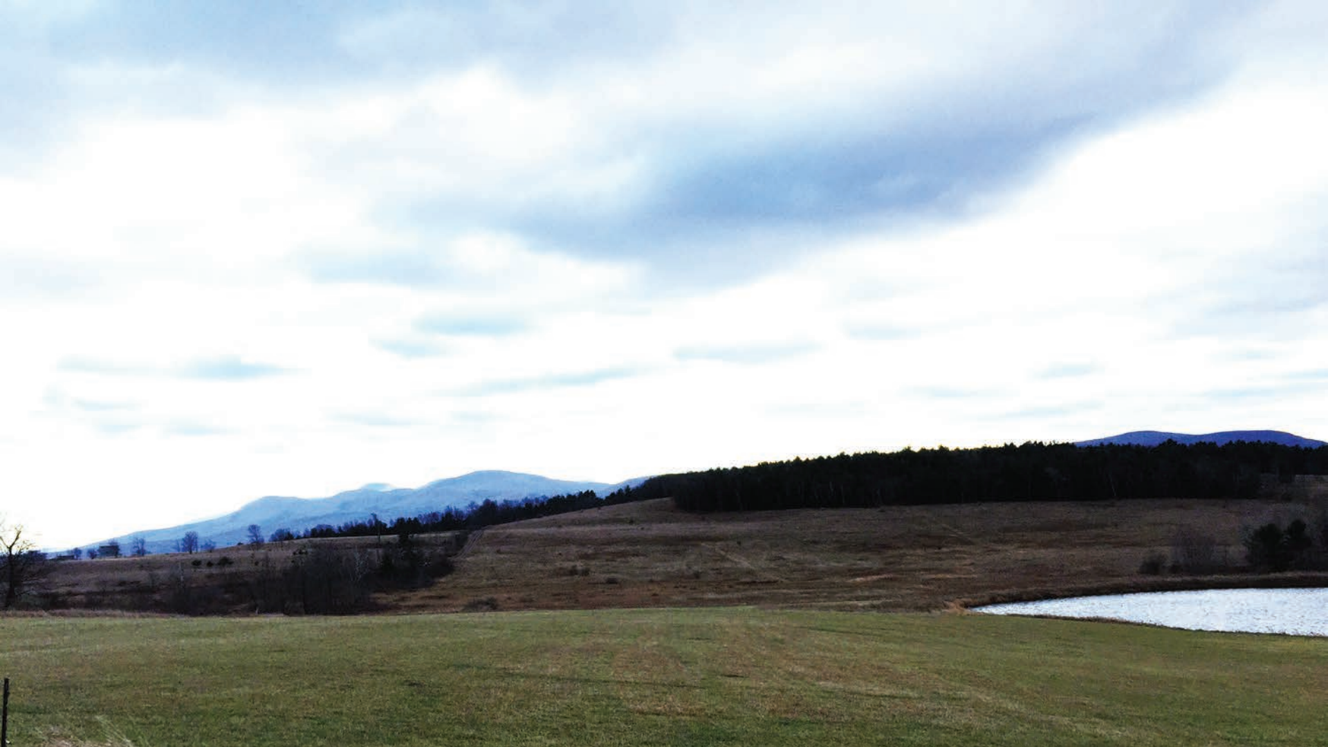
A Land Bank property in the Town of Rensselaerville